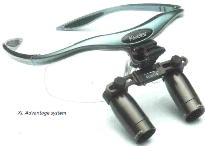
XL Advantage system

Higher magnification for advanced surgical procedures. Prismatic quality guarantees a true image. Edge to edge clarity and precise colour rendition is ideal for intricate applications. The XL's precision lenses are treated with an anti-reflective coating to produce a superior image.